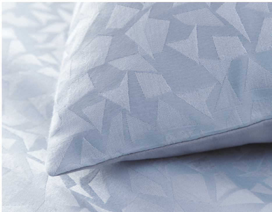
Above left to right: Topaz bedlinen silver, Venus cushion silver, Tessellate cushion, Opal cushion, Mercury cushion.