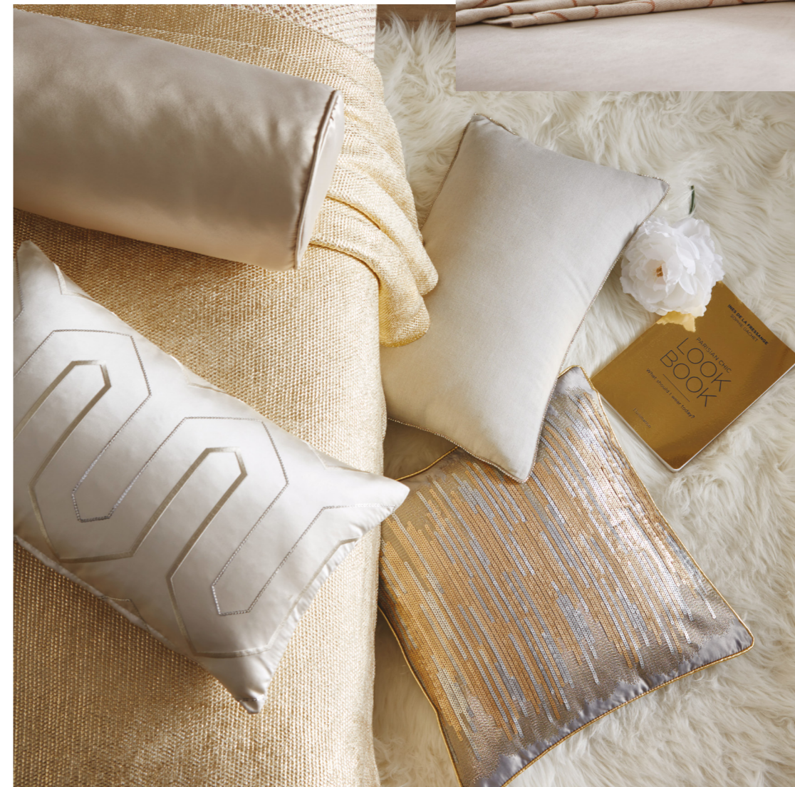
Above left to right: Splatter Foil print cushion, Knit throw gold, Bolster cushion, Diamante Trim boudoir, Phoebe boudoir cushion champagne, Shimmer Sequin cushion.