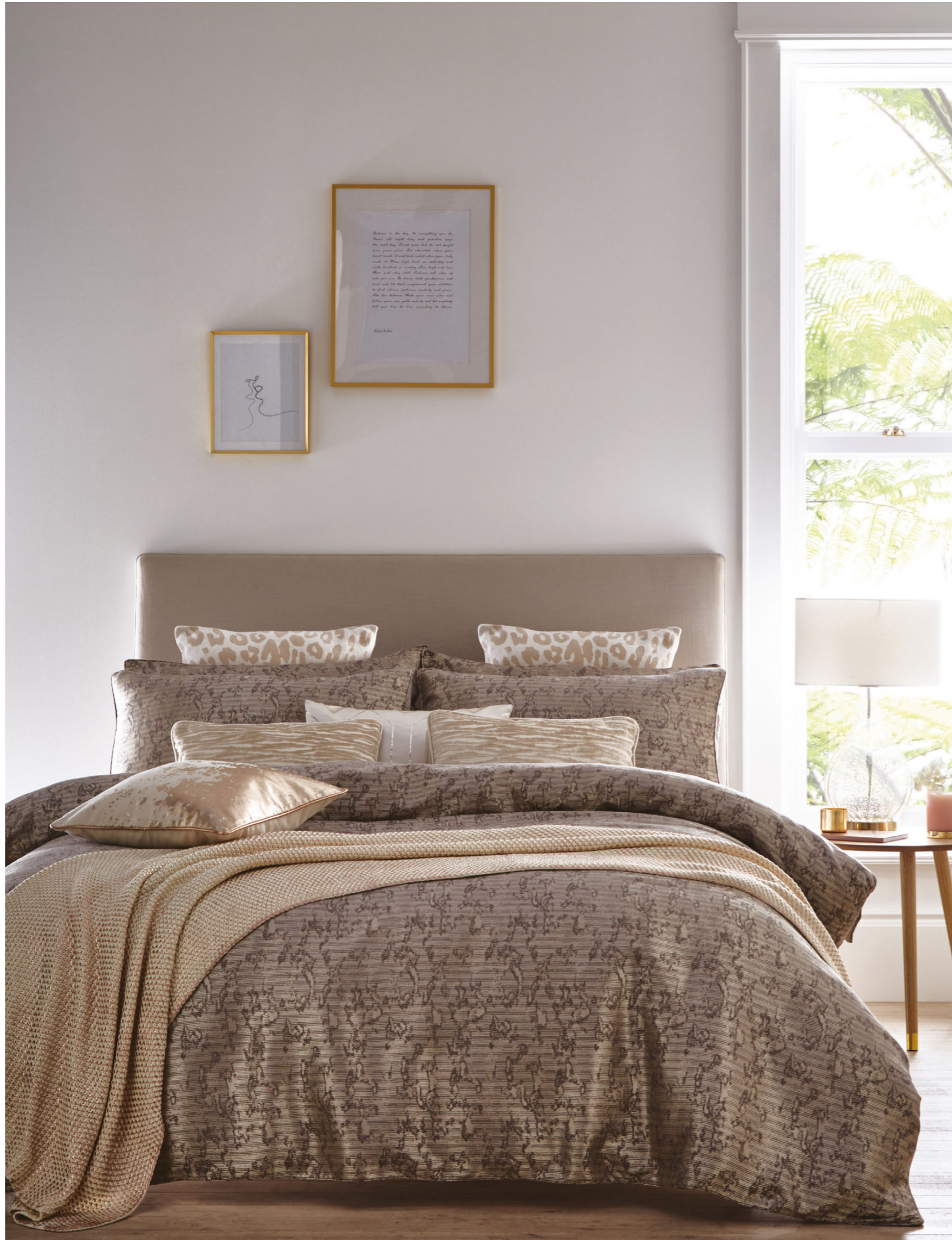
Above left to right: Knit Leopard cushion, Lux bedlinen, Phoebe boudoir cushion champagne, Splatter Foil print cushion, Knit throw rose gold.