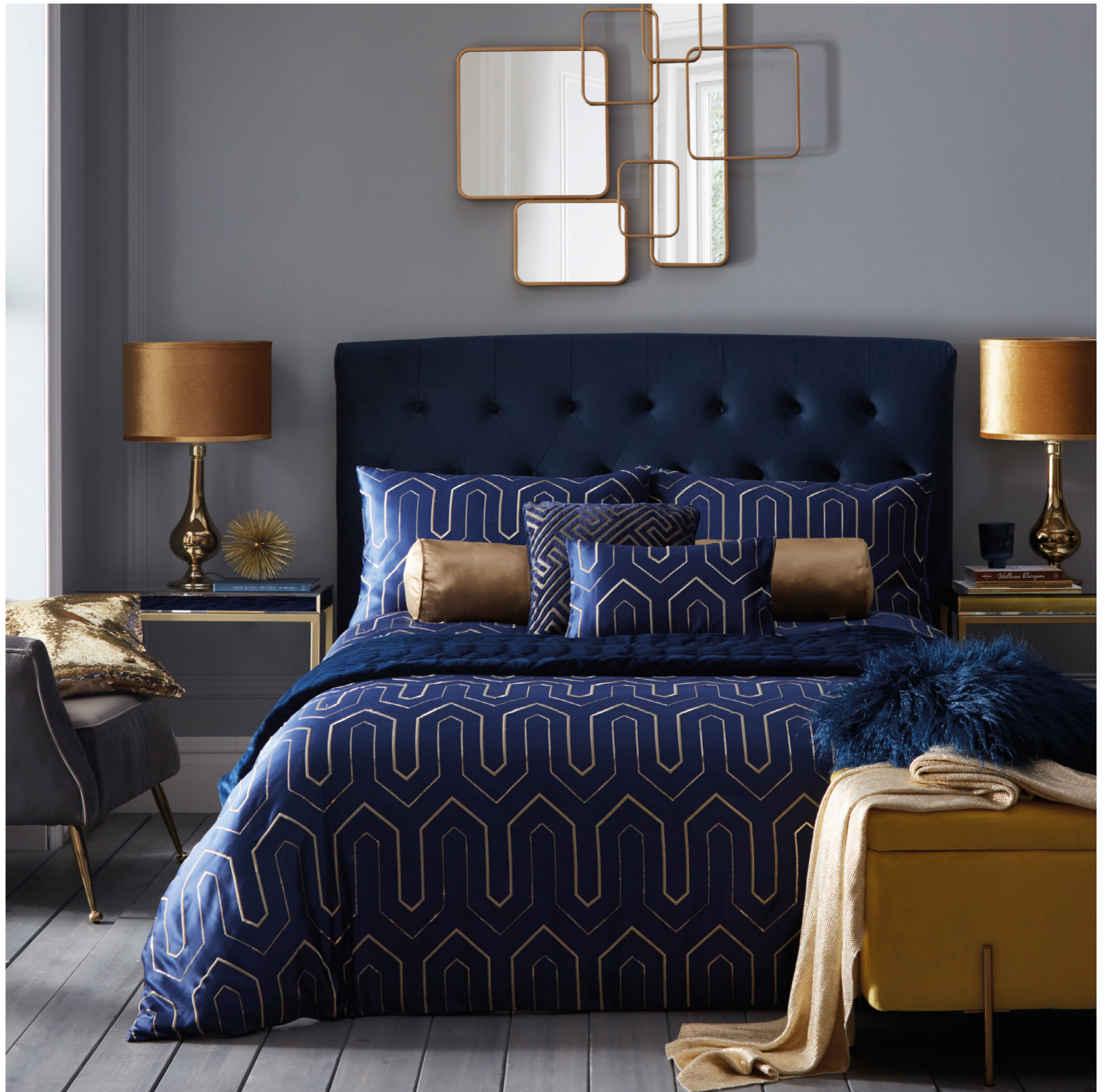
Above left to right: Sequin cushion gold, Phoebe bedlinen midnight, Geometric Velvet throw midnight, Bolster cushion, Phoebe Boudoir cushion midnight, Knit throw gold, Faux Mongolian cushion midnight.