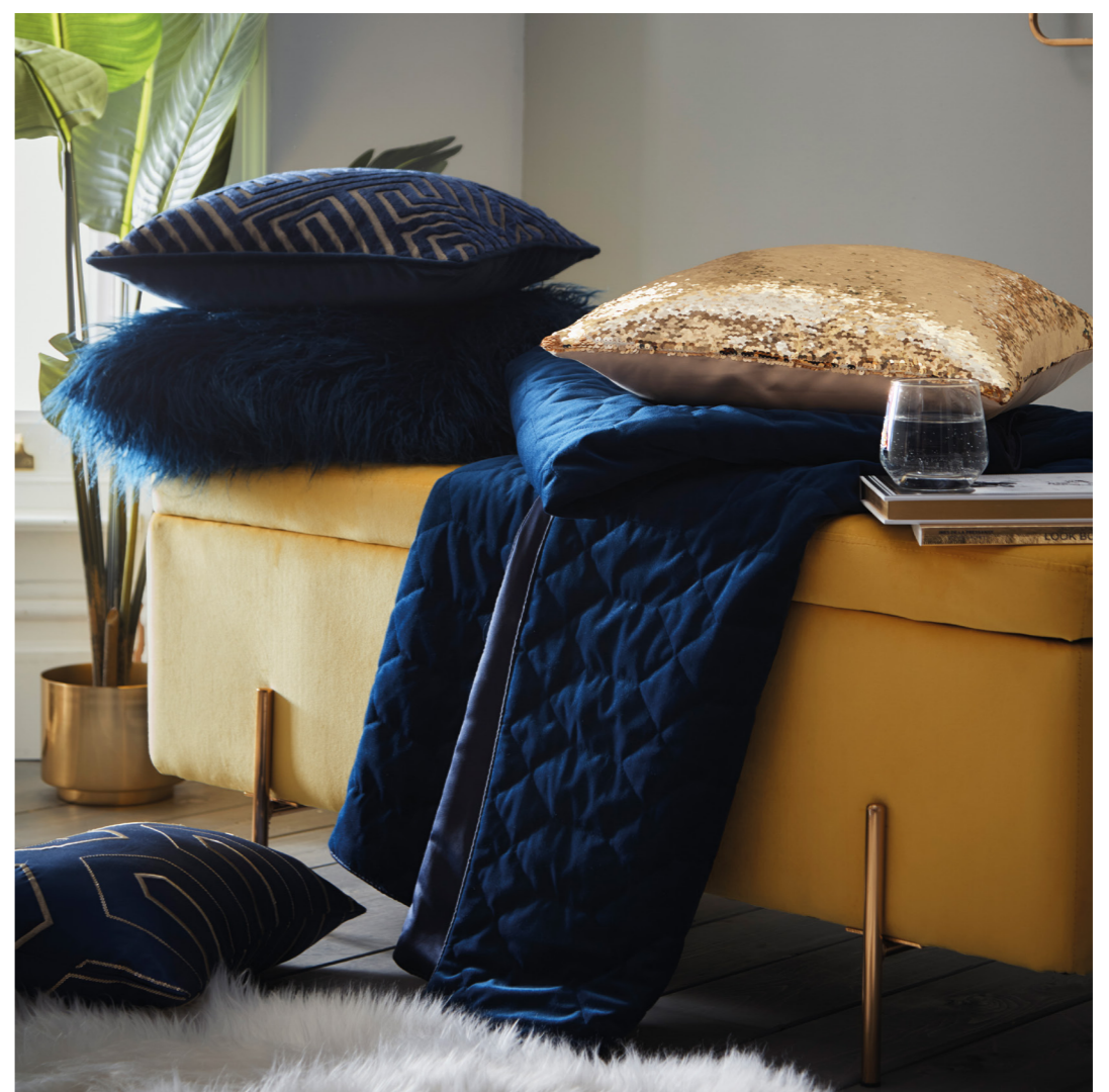
Left top to bottom: Topaz bedlinen midnight, Sequin cushion gold, Faux Mongolian cushion midnight, Knit throw gold Above top to bottom: Faux Mongolian cushion midnight, Sequin cushion gold, Geometric Velvet throw midnight, Phoebe cushion midnight.

A geometric jacquard comprised of intricate tessellated shapes. Topaz midnight adds a stylish edge to your bedroom.