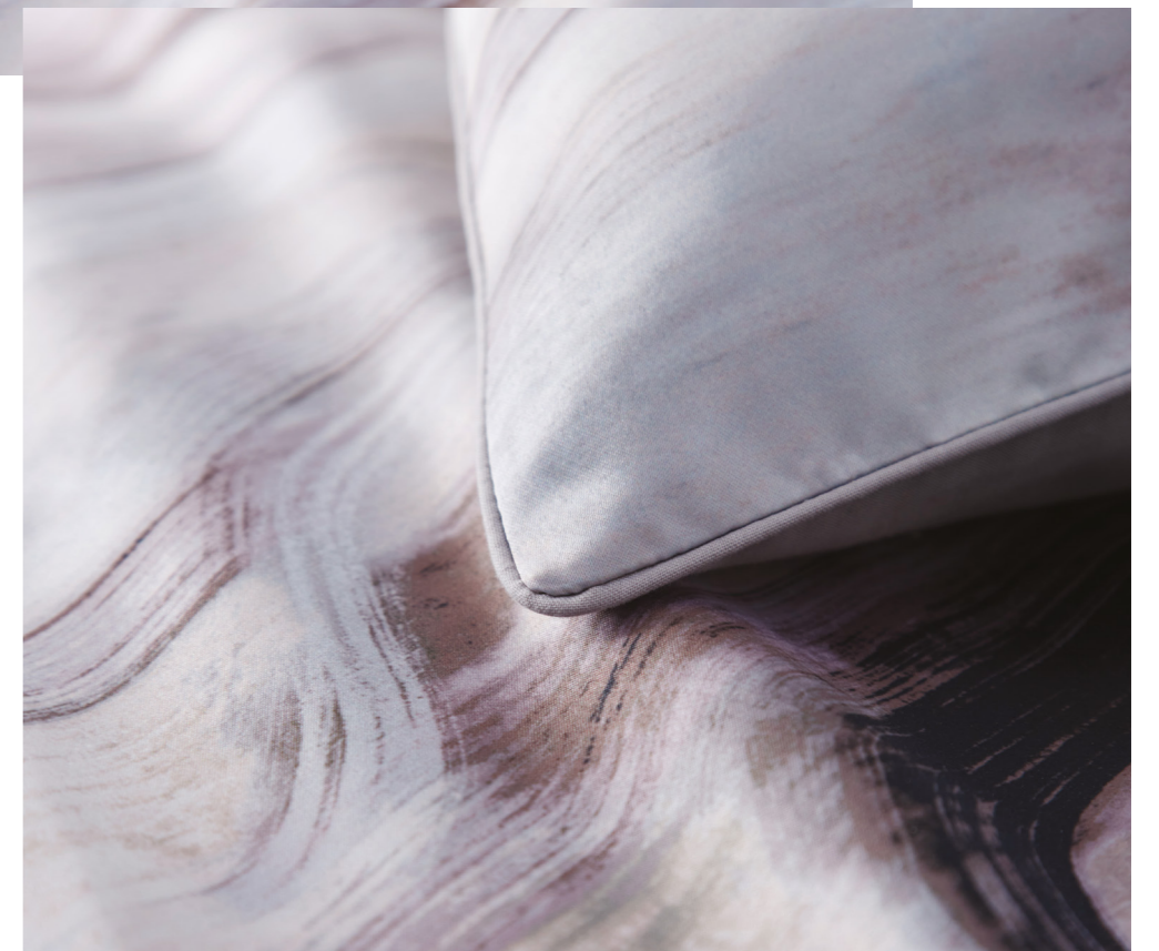
Left top to bottom: Galaxy bedlinen, Venus cushion silver, Saturn cushion.