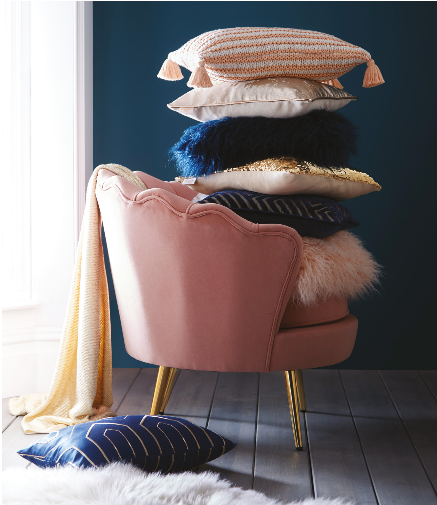
Above top to bottom: Knitted stripe cushion, Splatter foil print cushion, Faux Mongolian cushion midnight, Sequin cushion gold, Knit throw gold, Faux Mongolian cushion blush, Pheobe boudoir cushion midnight.