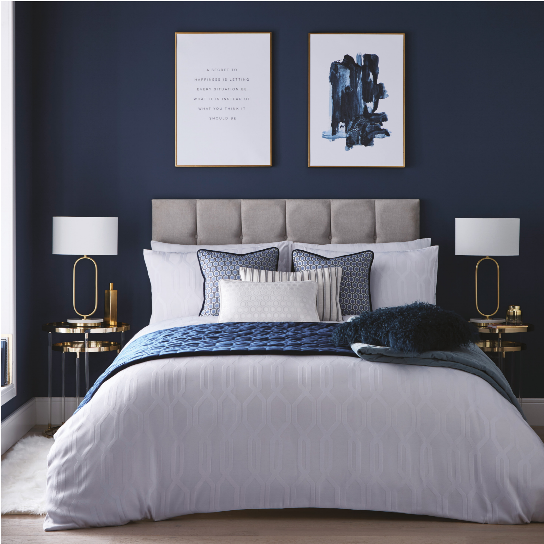
Above top to bottom: Quartz bedlinen, Hexagon cushion navy, Metallic Stripe boudoir, Hexagon boudoir cushion white, Geometric Velvet throw midnight and duckegg, Faux Mongolian cushion midnight.