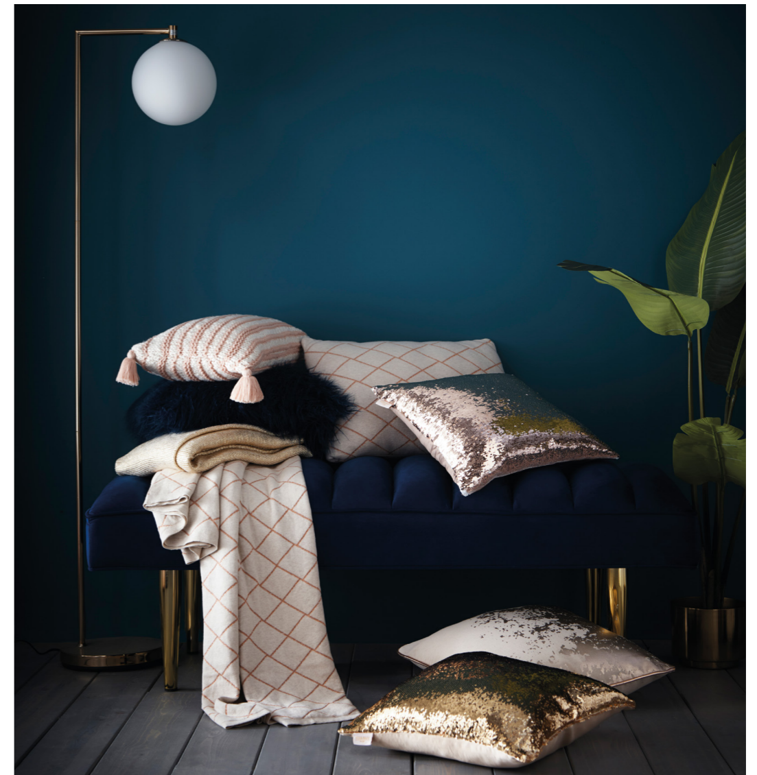
Left top to bottom: Amber pillowcases, Zebra bedlinen, Faux Mongolian cushion blush, Splatter Foil Print cushion, Sequin cushion rose gold, Knitted Stripe cushion, Knit throw gold Above top to bottom: Knitted Stripe cushion, Diamond Knit cushion, Faux Mongolian cushion midnight, Sequin cushion rose gold, Knit throw gold, Diamond Knit throw, Splatter Foil print cushion, Sequin cushion gold.

Add a touch of glamour to your bedroom with this sumptuous cotton jacquard. This fresh white bedlinen is finished with a sophisticated oxford edge. Style with the tasseled knitted stripe cushion and faux Mongolian cushion in blush for a cosy feel.