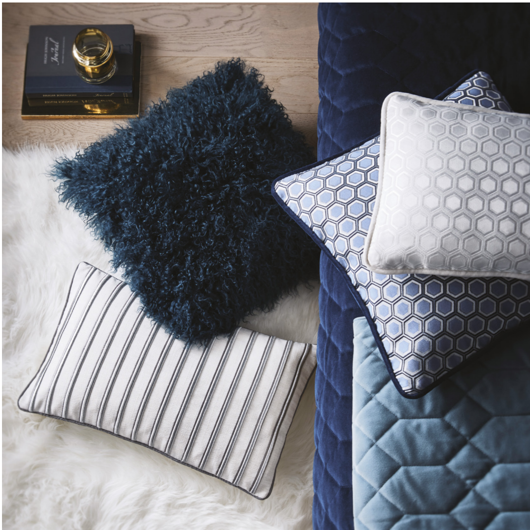
Above left to right: Faux Mongolian cushion midnight, Metallic Stripe boudoir, Geometric Velvet throw midnight & duckegg, Hexagon cushion navy, Hexagon boudoir cushion white.

Quartz bedlinen provides a contemporary update to your interior. For an extra touch of luxury, layer up with the Geometric velvet throw and accompanying Hexagon and Metallic Stripe cushions.