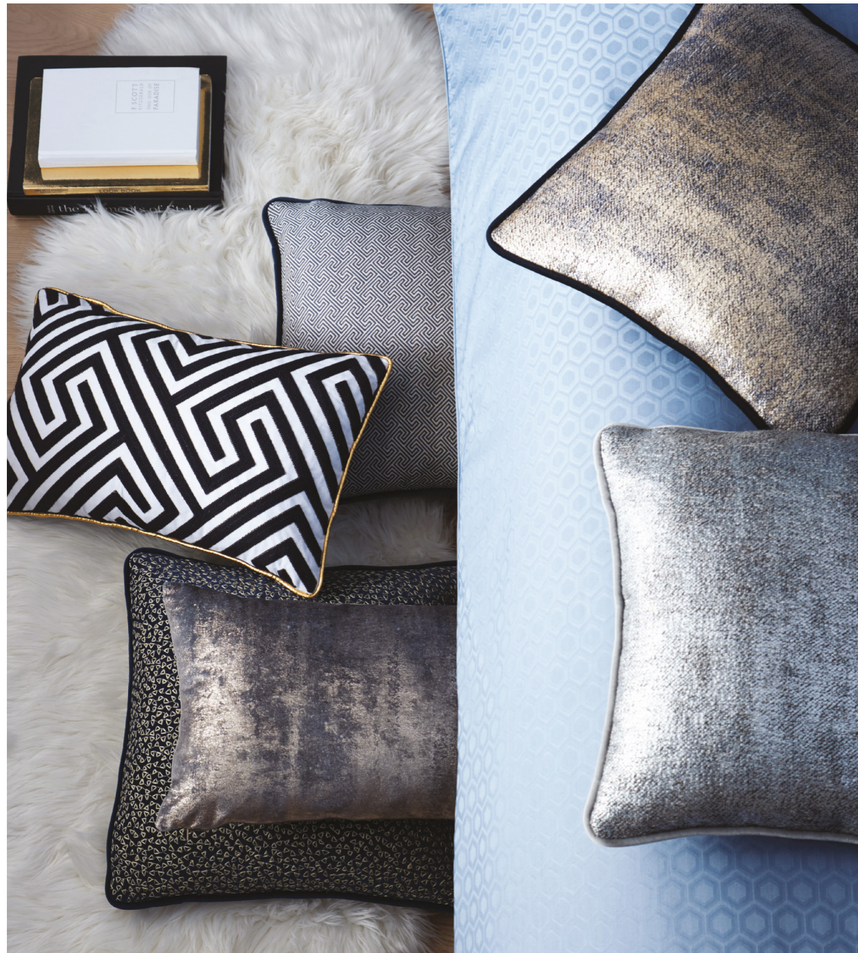
Above left to right: Tessellate cushion, Opal cushion, Saturn cushion, Mercury cushion, Hexagon bedlinen, Venus cushion midnight, Venus cushion silver. Right top to bottom: Venus cushions midnight, Hexagon bedlinen, Opal cushion, Tessellate cushion.

A restful night's sleep is guaranteed with the relaxing Twilight shade of Hexagon. Pair with the Venus midnight and Opal cushions for a subtle metallic shimmer or the striking Tessellate cushion, designed to create a statement.