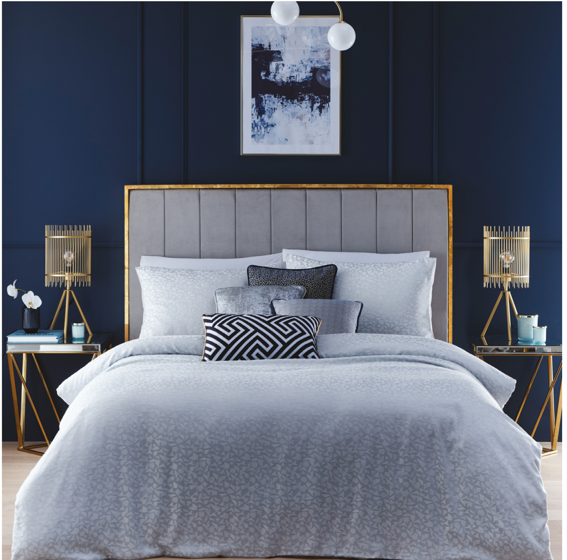
Above left to right: Topaz bedlinen silver, Tessellate cushion, Venus cushion silver, Opal cushion, Mercury cushion.