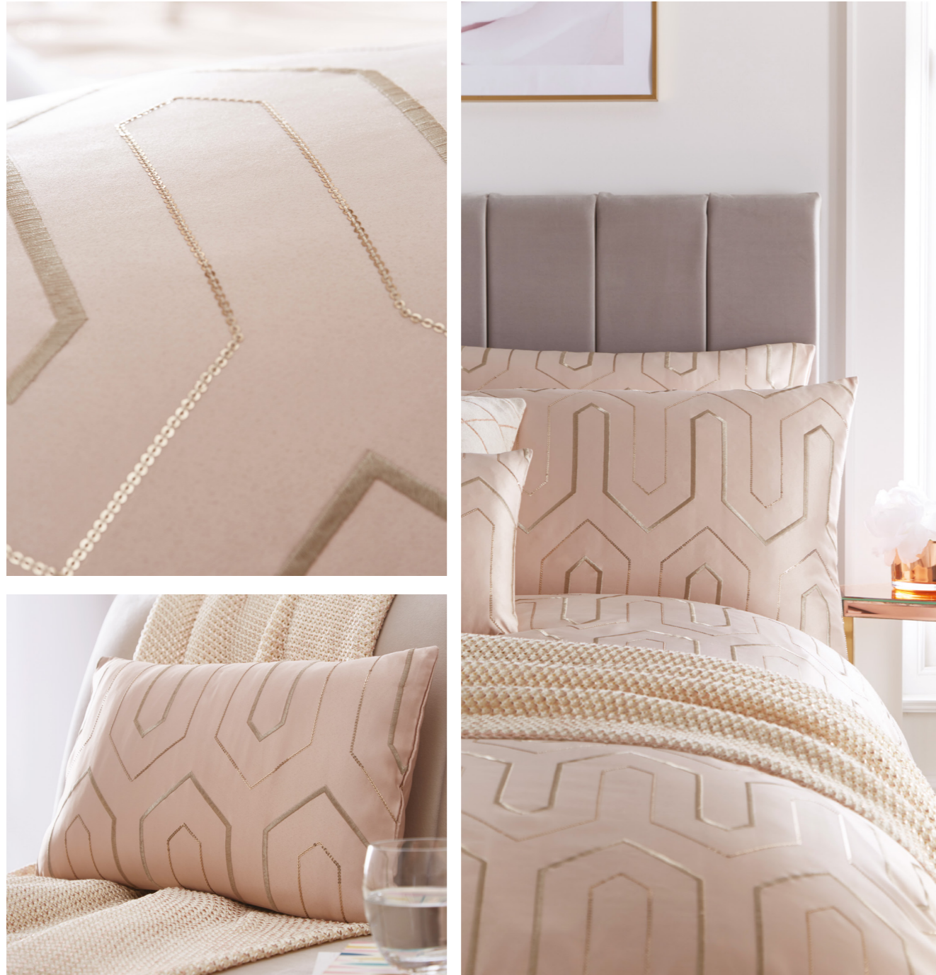
Above: Phoebe bedlinen blush, Phoebe boudoir cushion blush, Knit throw rose gold Right left to right: Bolster cushion, Phoebe bedlinen blush, Diamond Knit cushion, Phoebe boudoir cushion blush, Sequin cushion rose gold, Diamante Trim boudoir cushion, Faux Mongolian cushion blush, Knit throw rose gold, Diamond Knit throw.

Add a touch of 1920's glamour to your home. This lustrous blush embroidered design with intricate sequin detailing provides an art deco touch to your interior.