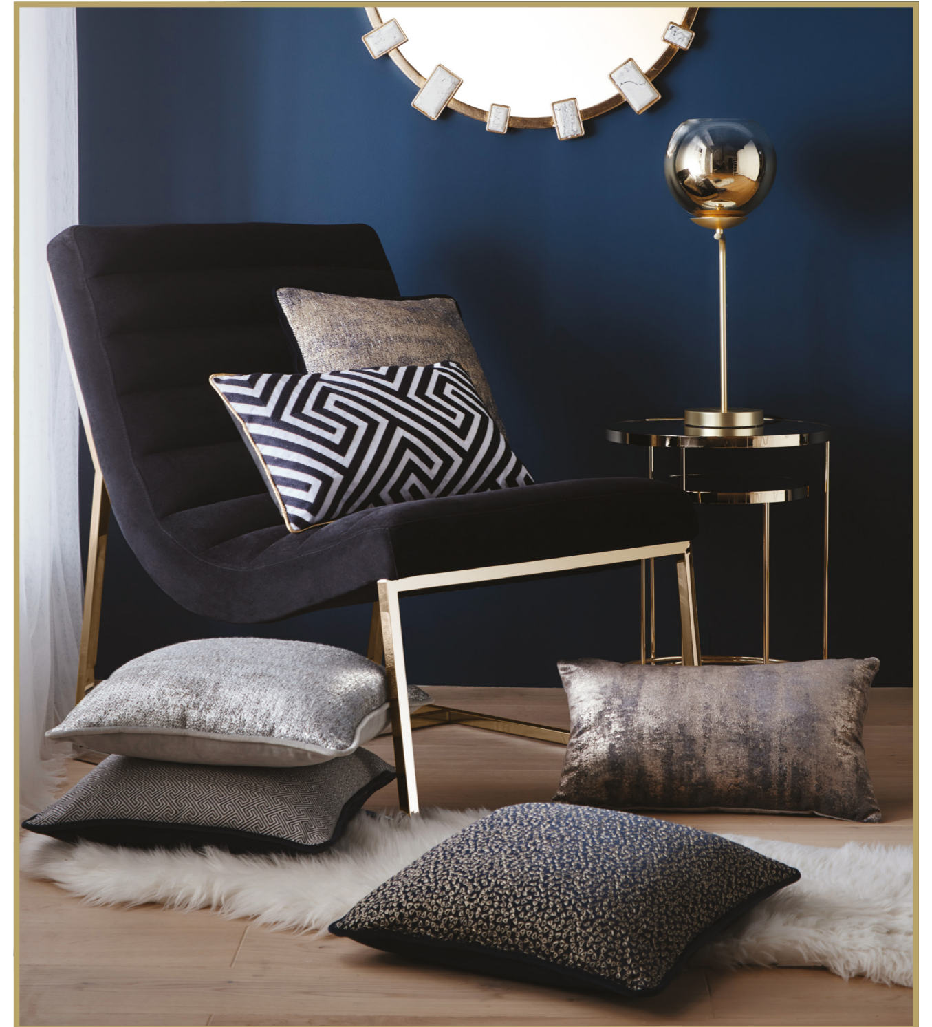
Above top to bottom: Venus cushion midnight, Tessellate cushion, Venus cushion silver, Saturn cushion, Mercury cushion, Opal cushion.