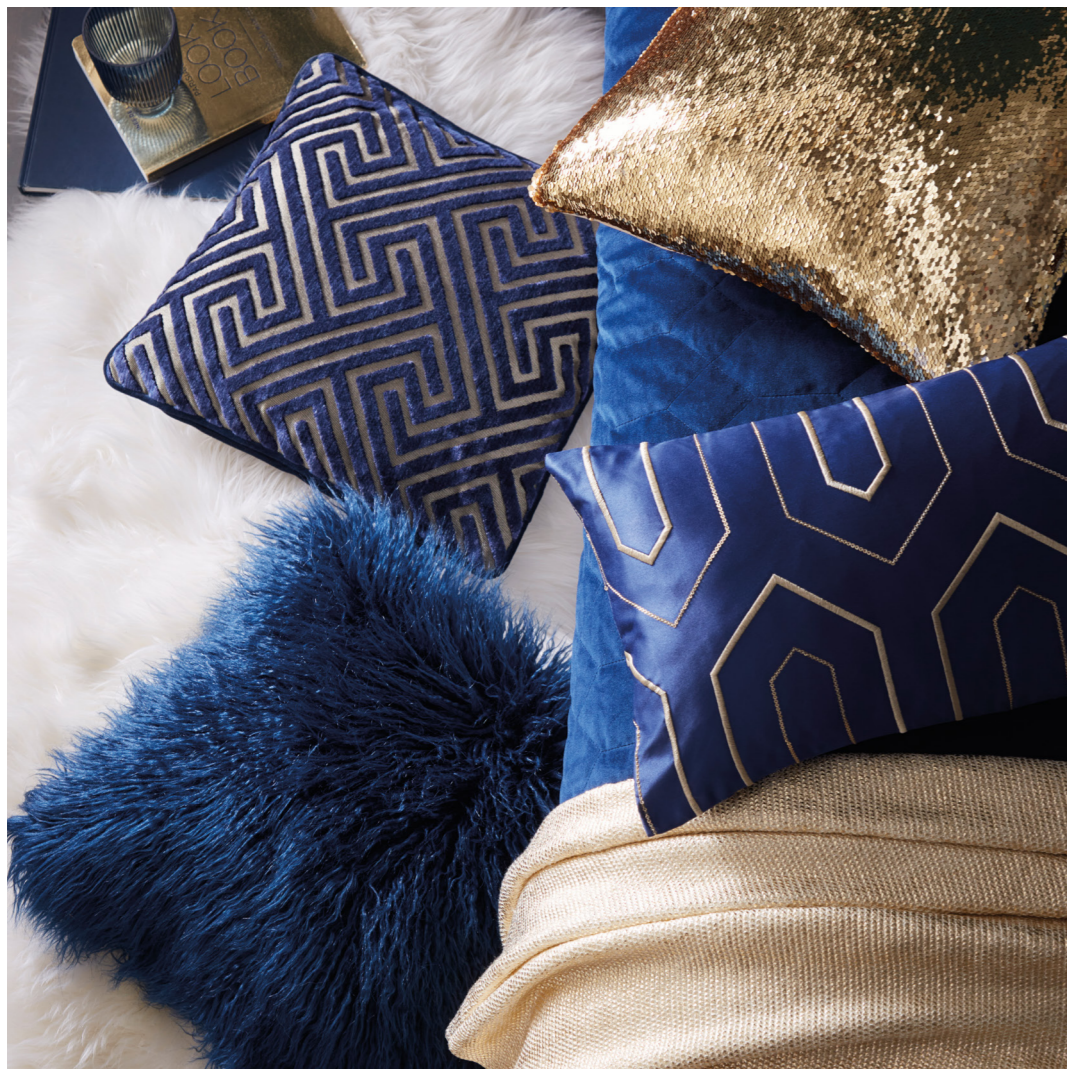
Above top to bottom: Sequin cushion gold, Geometric Velvet throw midnight, Phoebe Boudoir cushion midnight, Faux Mongolian cushion midnight, Knit throw gold.

Phoebe is reimagined in a decadent midnight colourway for an inspired art-deco look. The labyrinth pattern of gold embroidery works its way across this glamorous satin bedlinen, complete with sequin detailing. Add to the 1920s look with beautiful bolster cushions and coordinating Phoebe boudoir cushion in the same deep midnight colourway.