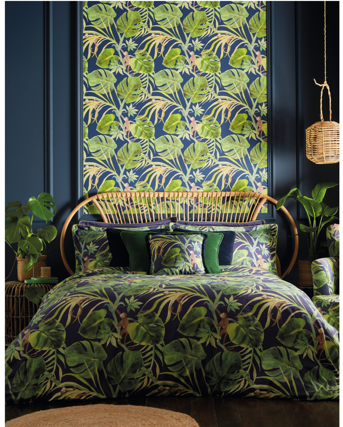
Top to bottom: Monkey Business wallcovering indigo, Monkey Business bedlinen set indigo, velvet cushions made from Alvar navy and hunter, Monkey Business cushion.