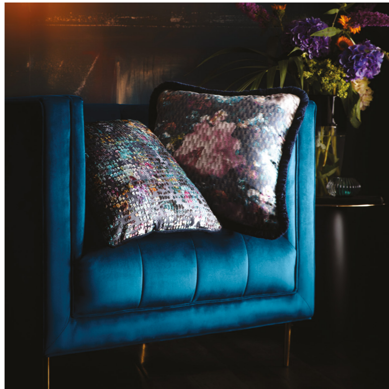
Top to bottom: Scintilla cushion, Camile cushion, Camile bedlinen set midnight.