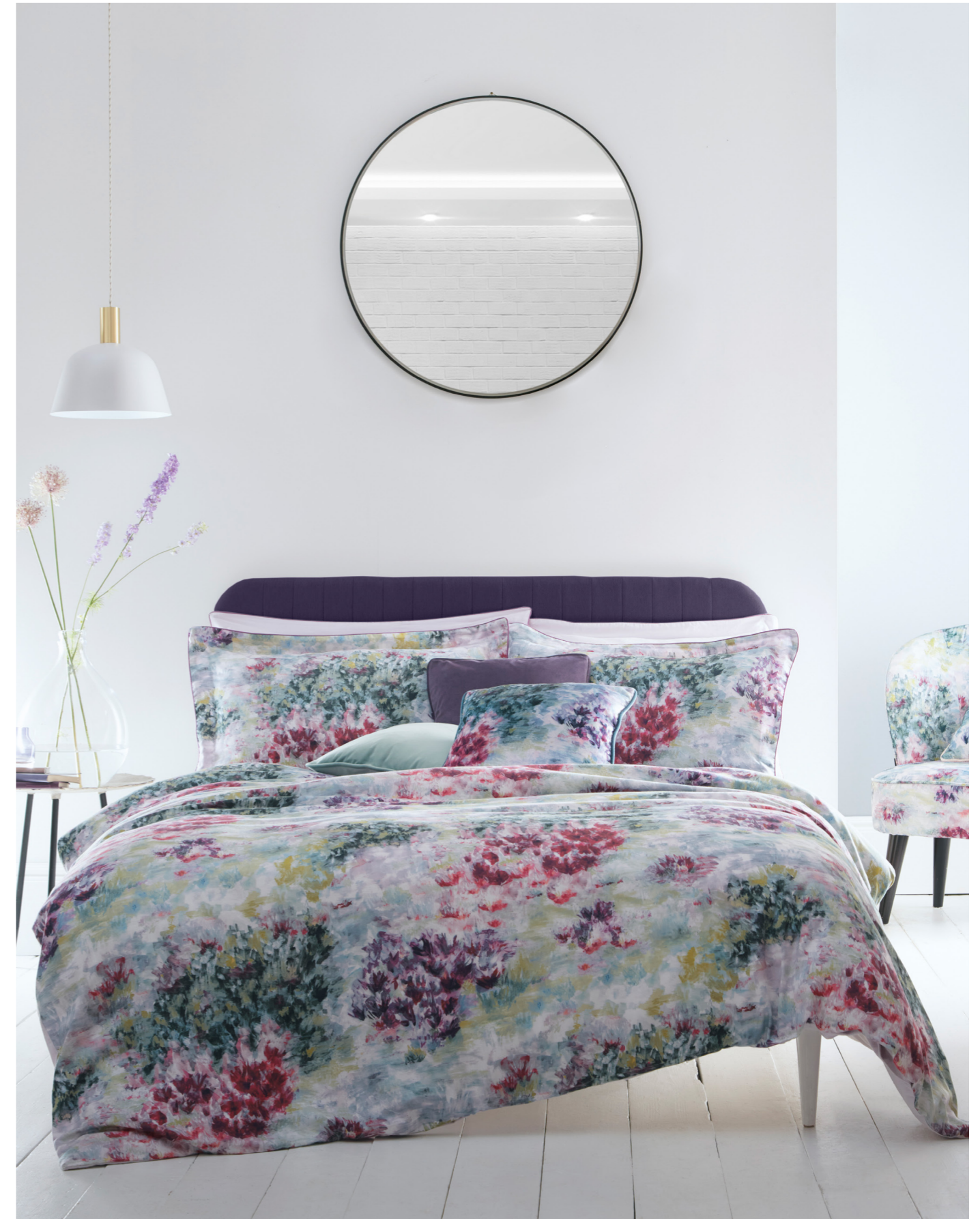
Left to right: Fiore bedlinen set amethyst/slate, velvet cushions made from Alvar amethyst and eau de nil, Fiore cushion, Ascot chair Fiore amethyst/slate.