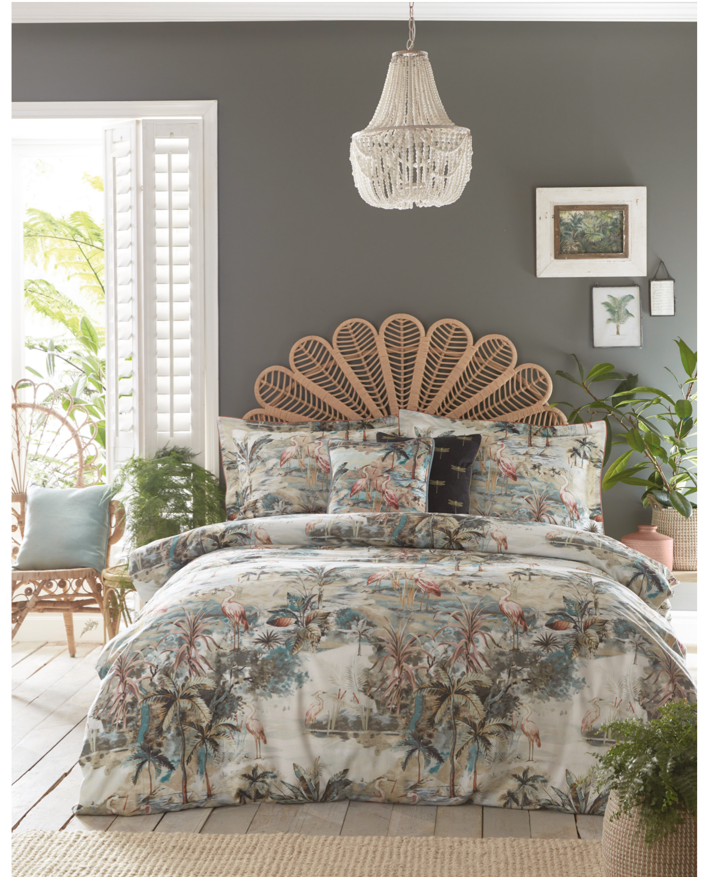
Left to right: Habitat bedlinen set mineral, Habitat cushion, Azure cushion.