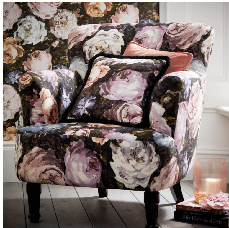
Top to bottom: Floretta bedlinen set blush, Dalston chair Floretta blush, velvet cushion Alvar rose, Floretta cushion.