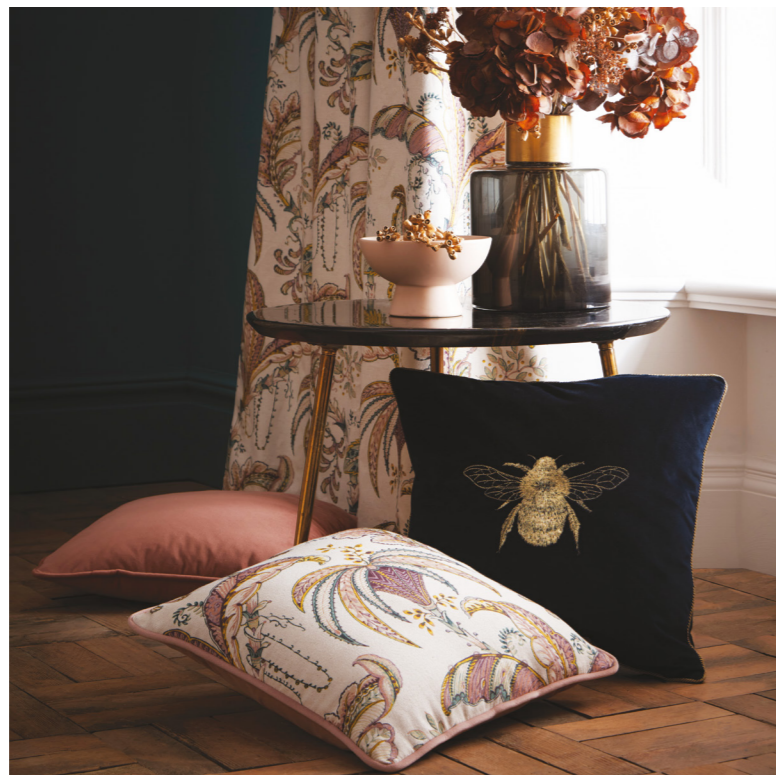
Top to bottom: curtain Ophelia fabric, velvet cushion Alvar rose, Abeja cushion, Ophelia cushion.