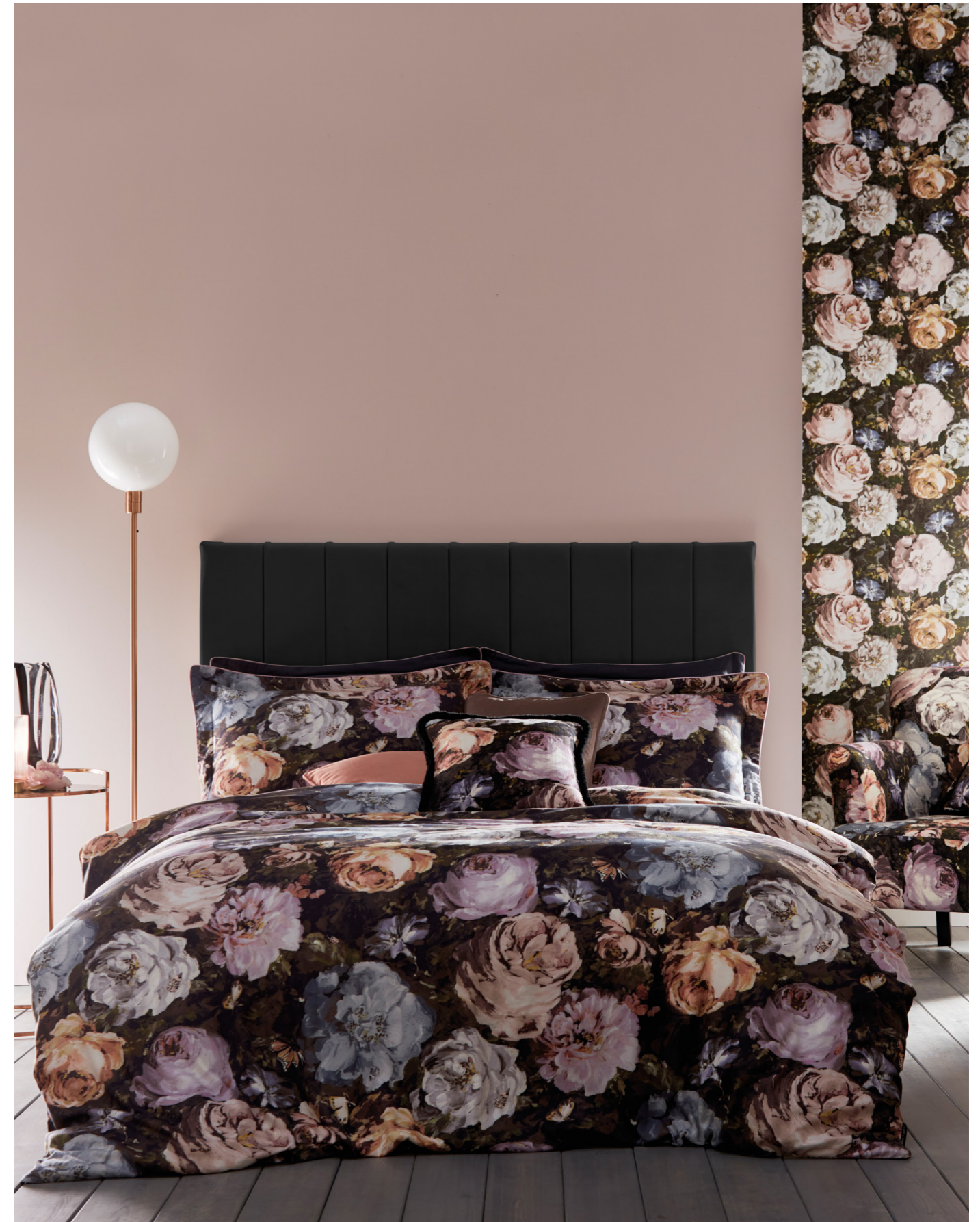
Left to right: Floretta bedlinen set blush, velvet cushions made from Alvar rose and ash, Floretta cushion, Floretta wallcovering blush/charcoal, Dalston chair Floretta blush.