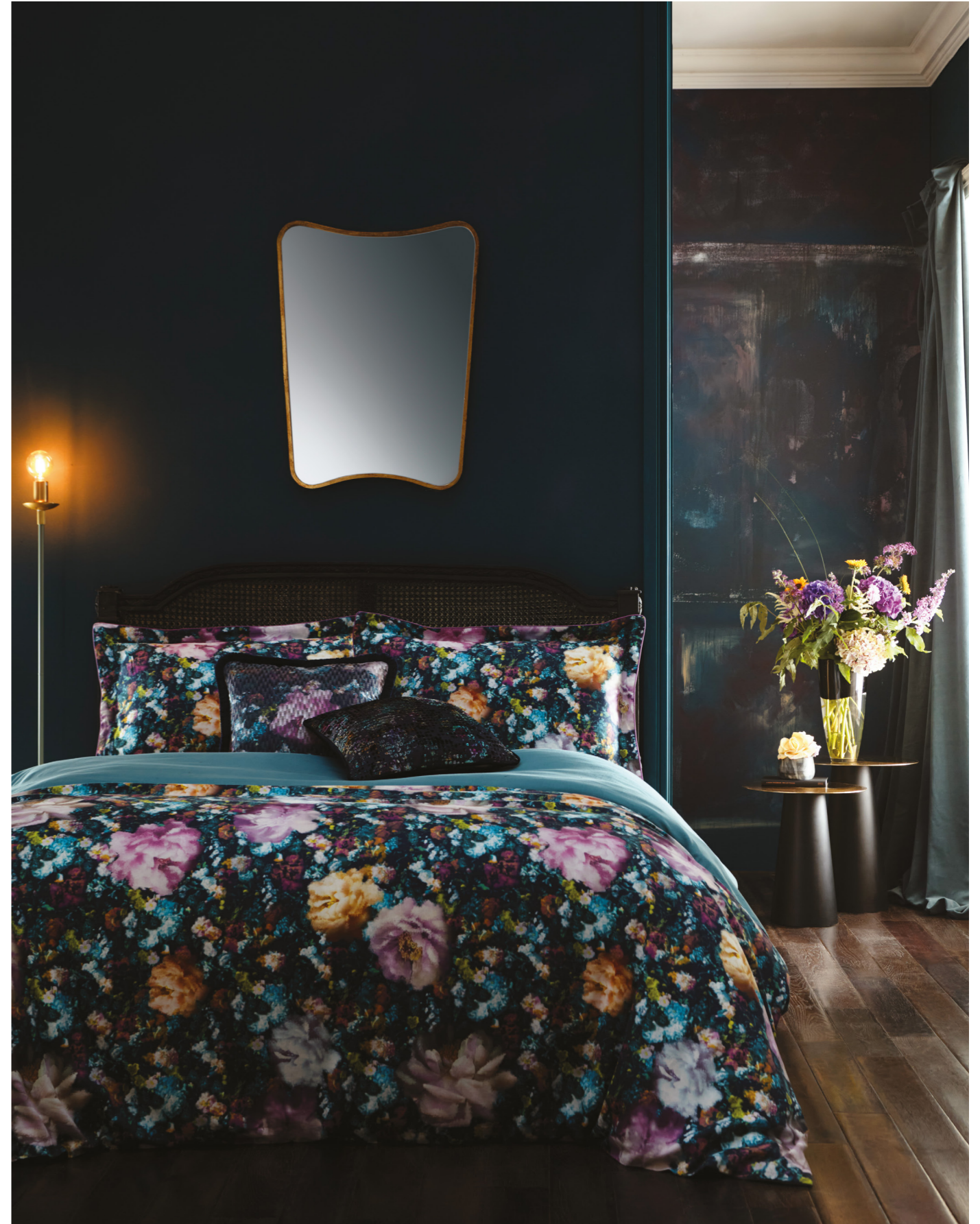
Left to right: Camile bedlinen set midnight, Camile cushion, Scintilla cushion.