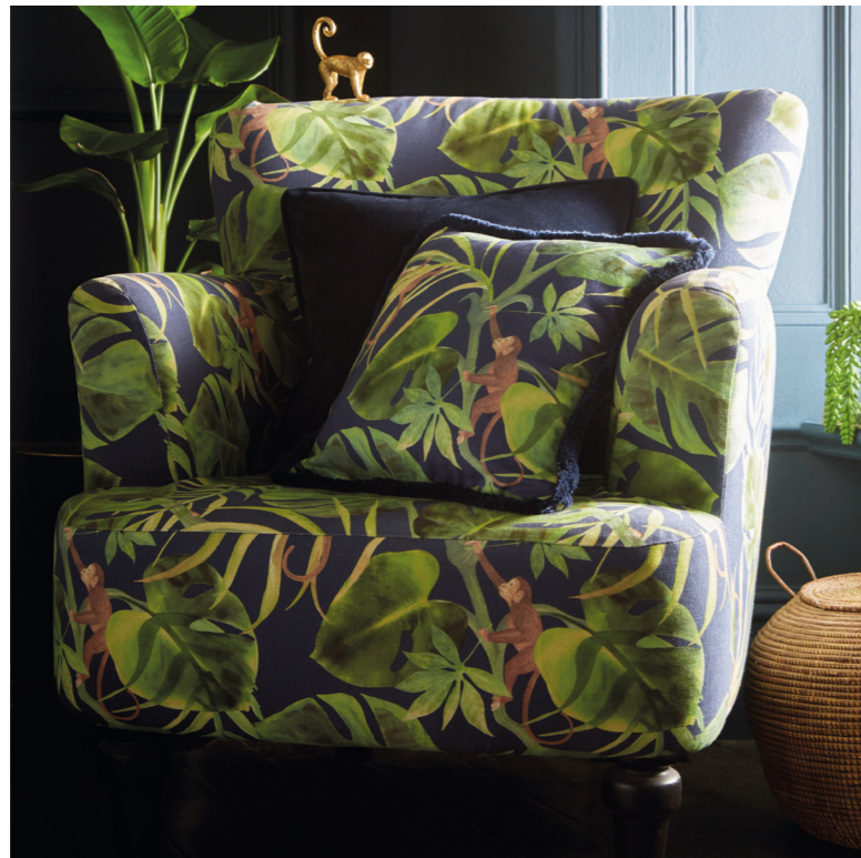
Top to bottom: Monkey Business bedlinen set indigo, Dalston chair Monkey Business indigo, velvet cushion Alvar navy, Monkey Business cushion.