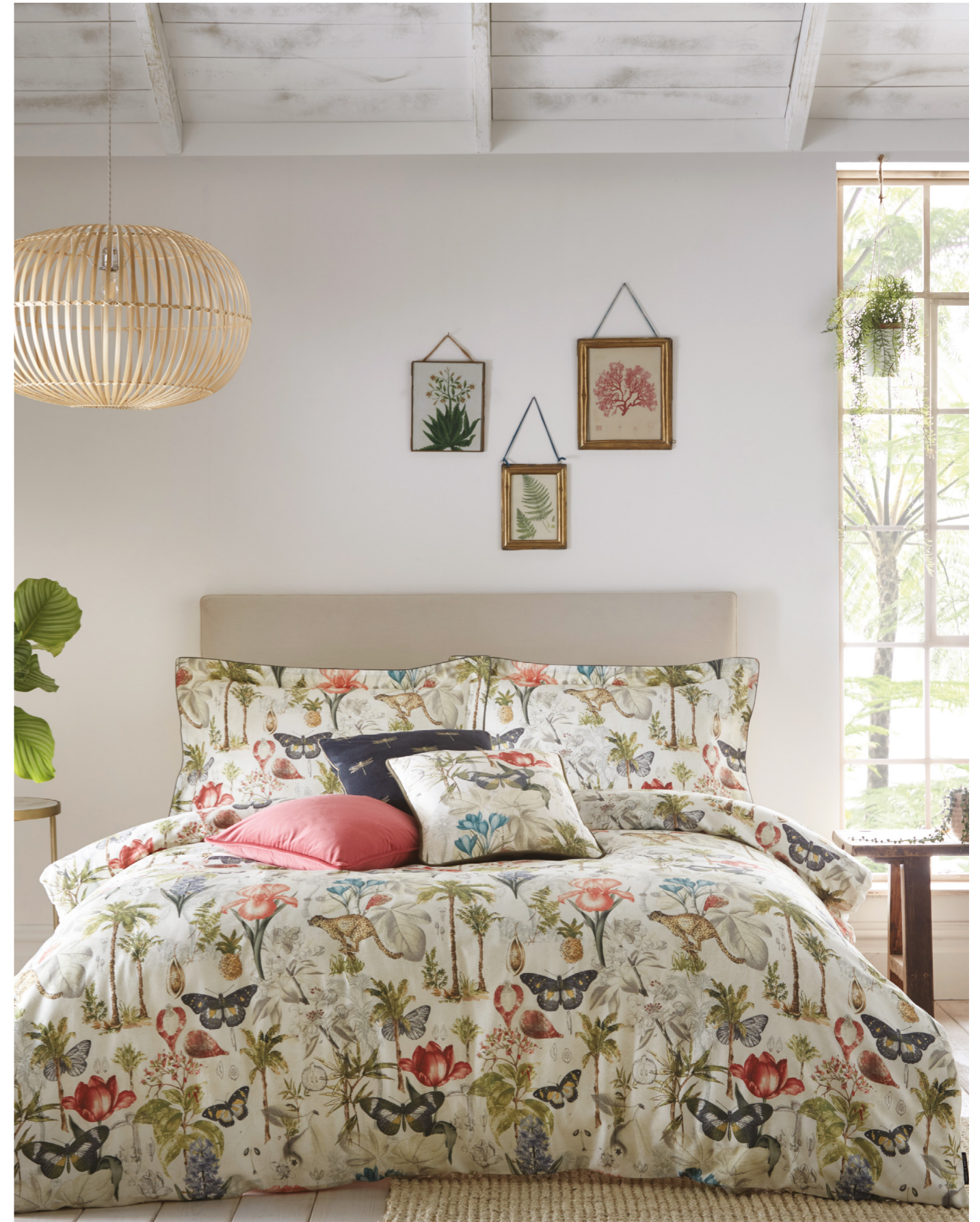
Left to right: Botany bedlinen set tropical, velvet cushion made from Alvar peony, Azure cushion, Botany cushion.