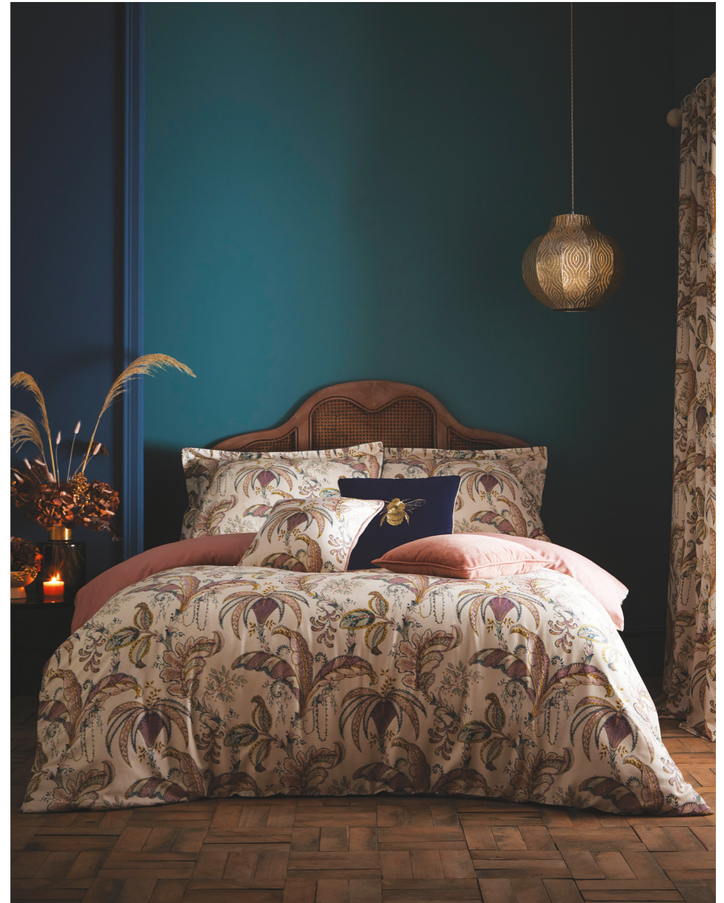
Left to right: Ophelia bedlinen set multi, Ophelia cushion, Abeja cushion, curtain Ophelia fabric.