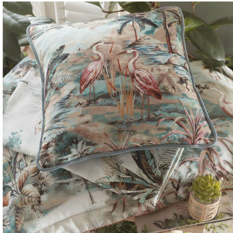
Top to bottom: Azure cushion, Habitat cushion, Habitat bedlinen set mineral.