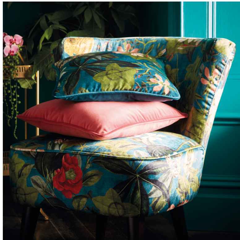
Top to bottom: Passiflora bedlinen set kingfisher, Passiflora cushion, Lexi chair Passiflora kingfisher.