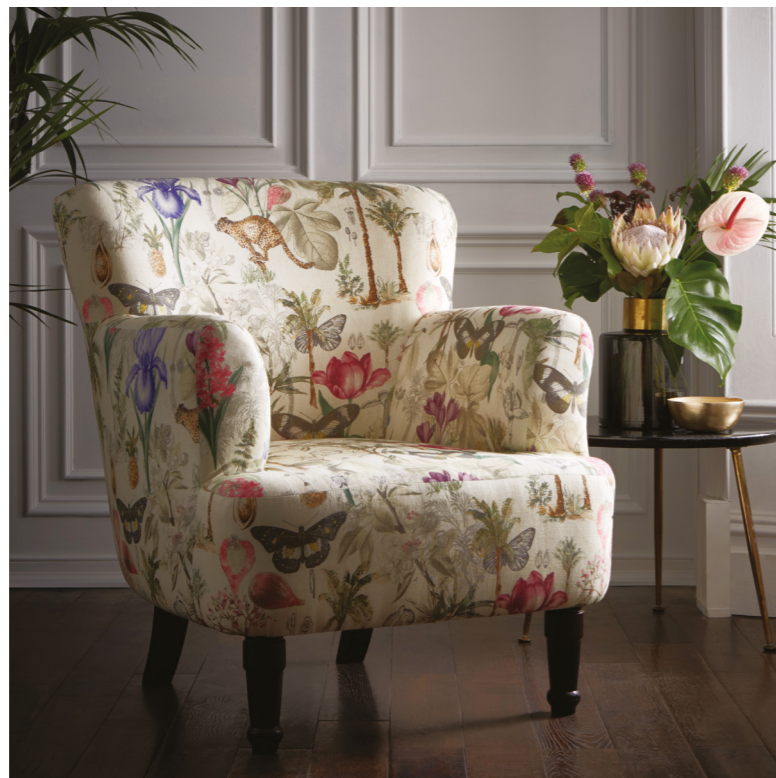
Top to bottom: Botany cushion, Botany bedlinen set tropical, Dalston chair Botany summer.