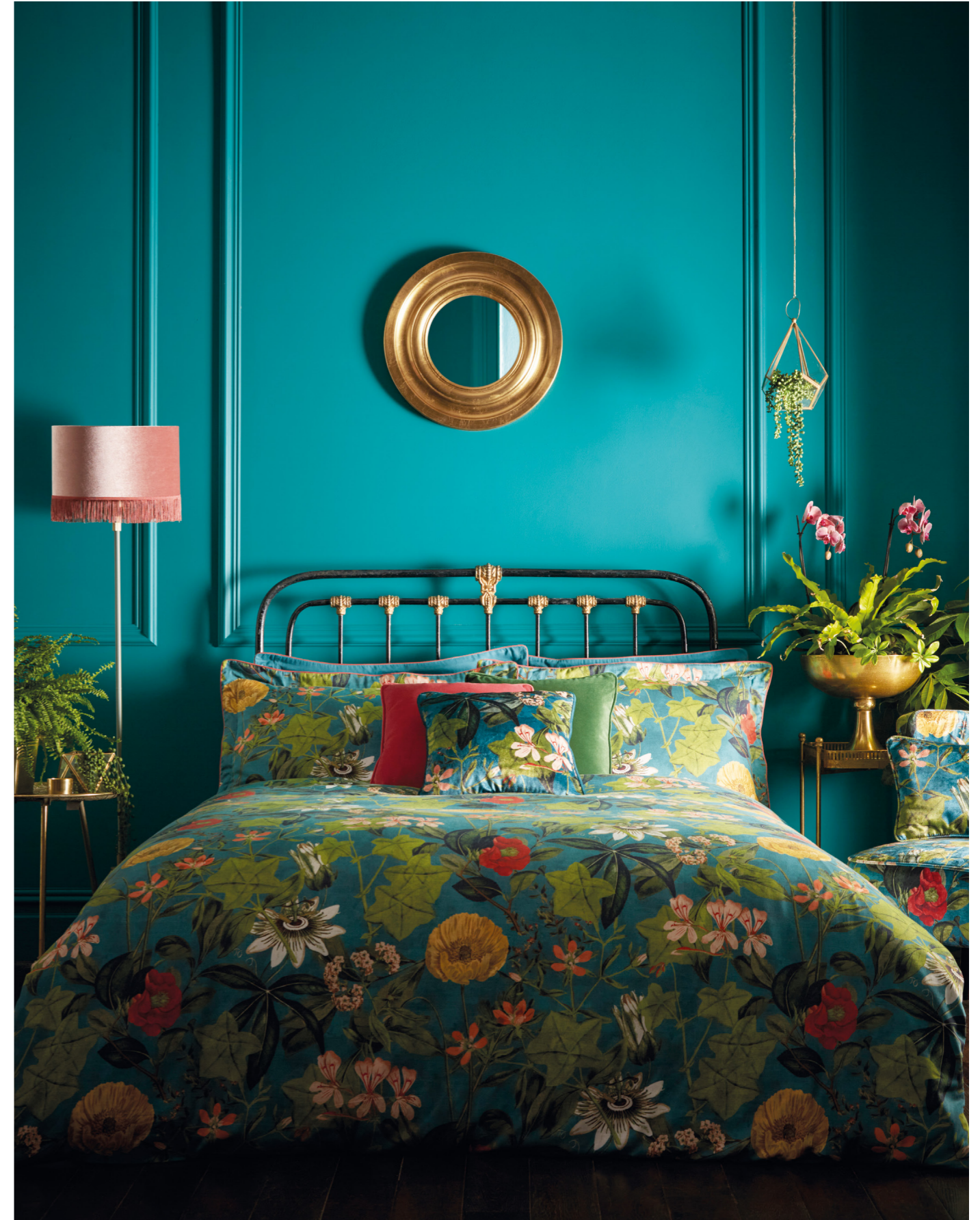
Left to right: Passiflora bedlinen set kingfisher, velvet cushions made from Alvar peony and hunter, Passiflora cushion, Lexi chair Passiflora kingfisher.